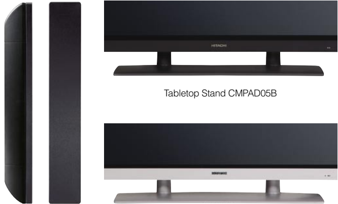
Speakers CMPAS14W Black (shown above) CMPAS14V Silver